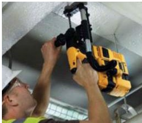
Worker drilling into concrete with a rotary hammer equipped with shroud and dust collection system. Note the shroud around drill bit, silver and black hose, and dust collector are attached conveniently to the drill.

The equipment shown in this picture is for illustrative purposes only and is not intended as an endorsement by OSHA of this company, its products or services.