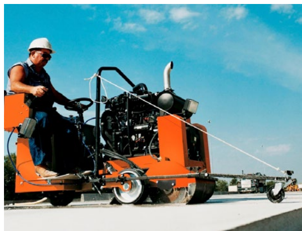
Worker cutting a groove in concrete roadway with drivable saw using integrated water delivery system.

Respiratory protection is not required for work with drivable saws regardless of task duration.