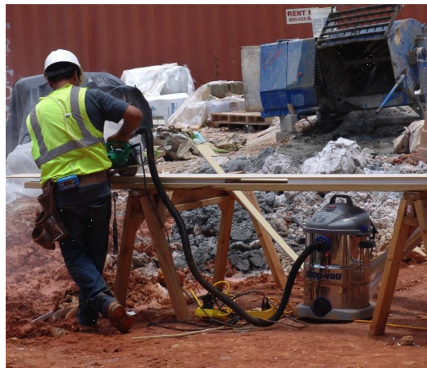
Worker cutting fiber-cement board outdoors using a handheld power saw and dust collection system. The dust collection system consists of the shroud on the saw, hose, and dust collector positioned between the saw horses.

Respiratory protection is not required for work outdoors with specialty handheld power saws while cutting fiber-cement board regardless of task duration.