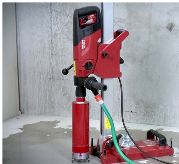
A rig-mounted core drill with an integrated water delivery system.

Respiratory protection is not required for work with rig-mounted core saws or drills regardless of task duration.