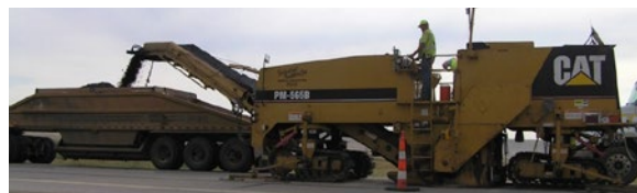
Milling machine milling asphalt road and loading debris into a haul truck.

Respiratory protection is not required for work with large drivable milling machines (half-lane or larger) regardless of task duration.