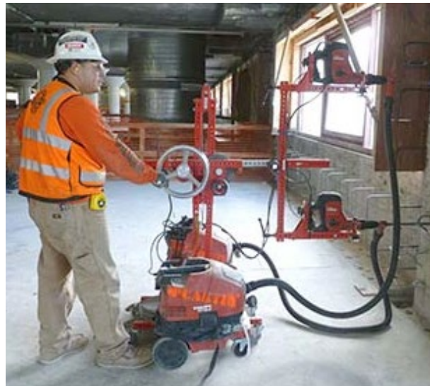
Worker is drilling horizontal holes in a concrete wall using two stand-mounted drills, each equipped with a dust collector. Note the shrouds around drill bits, black hose, and dust collector are attached to the stand.

Respiratory protection is not required when using handheld or stand-mounted drills equipped with a dust collection system, including for overhead drilling, regardless of task duration.