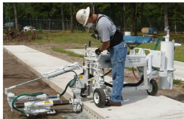
Worker drilling horizontal holes in concrete slab with a dowel drilling rig. The shroud surrounds the drill steel where it enters the concrete and the dust collector is the canister on the right. Worker is wearing respiratory protection.

Respiratory protection with a minimum APF of 10 is required for all work with dowel drilling rigs for concrete regardless of task duration.