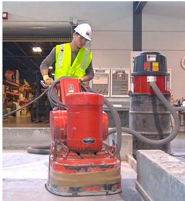
Worker milling granite floor indoors with milling machine and dust collection system (background).

Respiratory protection is not required for work with walk-behind milling machines and floor grinders regardless of task duration.