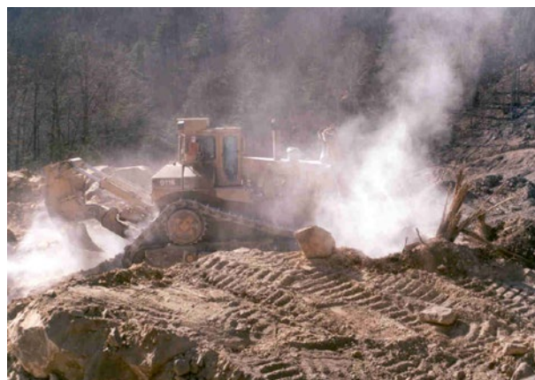
Earthmoving using a dozer equipped with enclosed operator cab.

Respiratory protection is not required for work with heavy equipment when it is operated from within an enclosed cab, or when water or other dust suppressants are used, regardless of task duration.