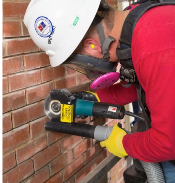
Worker grinding mortar from between bricks with a handheld grinder equipped with a shroud and dust collection system. In addition, worker is using respiratory protection.

Respiratory protection with a minimum APF of 10 is required for work with handheld grinders for mortar removal lasting four hours or less in a shift. Respiratory protection with a minimum APF of 25 is required for work lasting more than four hours per shift.