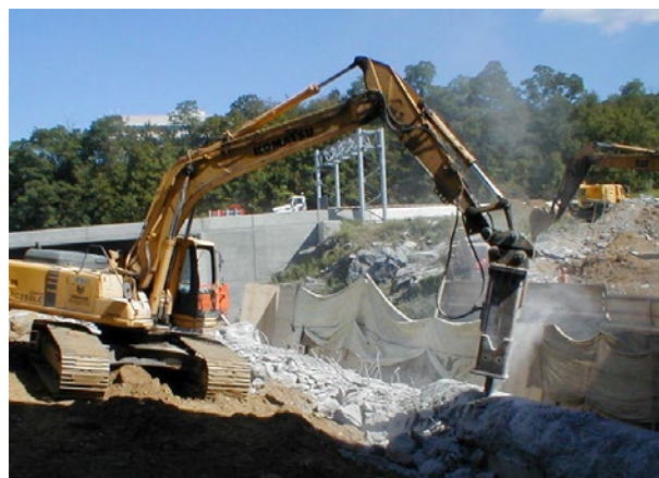
Excavator equipped with an enclosed cab and hoe-ram demolishing a concrete wall.

NOTE: When the operator exits the enclosed cab and is no longer actively performing the task, the operator is considered to have stopped the task. However, if other abrading, fracturing, or demolition work is performed by other heavy equipment and utility vehicles in the area while an operator is outside the cab, that operator is considered to be an employee “engaged in the task” and must be protected by the application of water and/or dust suppressants.