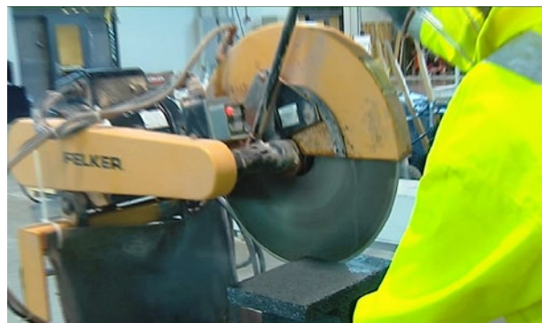
Worker cutting masonry block on a stationary masonry saw equipped with integrated water delivery system that continuously feeds water to the blade. Note water supply hose attached to top of shroud around blade.

Respiratory protection is not required for work with stationary masonry saws regardless of task duration.