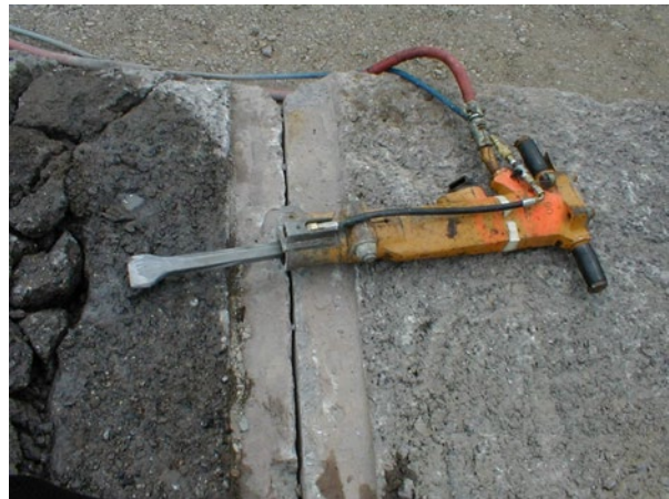
Jackhammer equipped with water spray delivery system to control dust. The water nozzle is mounted on the jackhammer frame just to the right of the chisel. Note the wet concrete on left from the water spray.

When working indoors or in an enclosed space (areas where airborne dust can buildup, such as a structure with a roof and three walls), employers must provide additional exhaust, as needed to minimize the accumulation of visible airborne dust. See the section on Indoors or Enclosed Areas for more information.