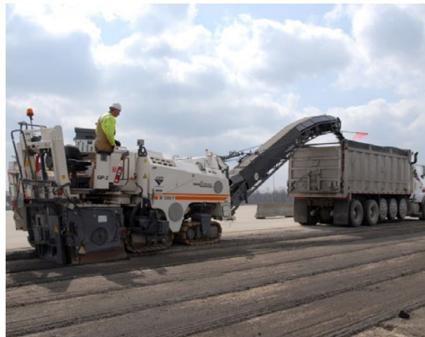
Milling machine milling asphalt road and loading debris into haul truck.

Respiratory protection is not required for work with small drivable milling machines (less than half-lane) regardless of task duration.