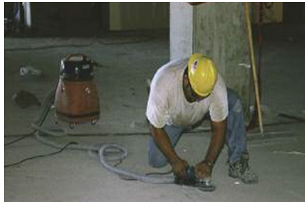
Worker grinding concrete floor with grinder attached to dust collector (background).

When using handheld grinders indoors or in enclosed areas (areas where airborne dust can buildup, such as a structure with a roof and three walls), employers must provide additional exhaust as needed to minimize the accumulation of visible airborne dust. See the section on Indoors or Enclosed Areas for more information.